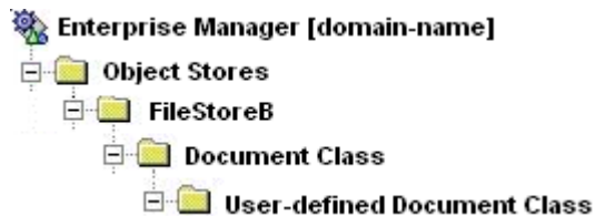
Figure 5. FileNet Content Manager Domain

The FileNet Content Manager permissions may behave differently in this release script than in the FileNet Content Manager Workplace Thin client. For example, if you give access permissions to the User-defined Document Class node (as shown in Figure 5) and do not give access to the Document Class node (also known as the system class node in FileNet Content Manager), the release will fail with an error.